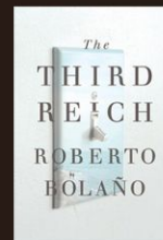
The Third Reich Roberto Bolaño