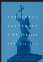
The Angel Esmeralda Don DeLillo