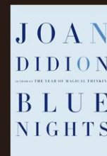
Blue Nights Joan Didion