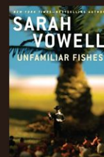
Unfamiliar Fishes Sarah Vowell