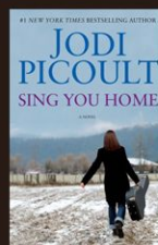
Sing You Home Jodi Picoult