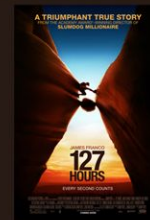
127 Hours (James Franco and Lizzy Caplan)