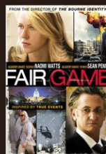
Fair Game (Naomi Watts and Sean Penn)